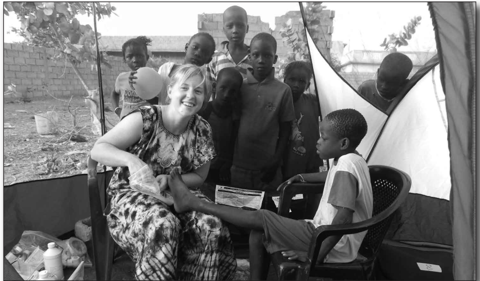
Medical Care for African Children during CFH's June Mission Trip to Senegal

villages, and community seed banks in 5 villages. The success of these Community Health Evangelism project hinged upon the education of tribal leaders regarding disease and its prevention. CFH also purchased Biblical teaching materials for WM's Christian leadership training programs.