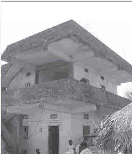
Widow's prayer house.

Widow's House Update: In 2010 CFH funded the construction of a widow's house in the province of Andhra Pradesh. That year walls, windows and doors were added to the first level of the building, and six widows moved into the structure. The ministry also provided funds for several water buffalos and for the construction of a village rice field to provide food and financial support for the widows. We are delighted to report that the Widow's House Project has been hugely successful. Villagers recently harvested the first rice crop and planted a second crop, which can grow during the dry season. The cottage industry undertaken by Christian women in the village flourishes on the second floor of the widow's house. This CHE sewing program is gradually raising funds to purchase updated machines to provide income for the Community Health Evangelism ministry. More importantly, the village church is booming with more than 200 members. Having outgrown its current meeting place (a buffalo shed in the widow's house compound), the church began building on a piece of land adjacent to the widow's house. Church members donated additional sections of land for the church, and the foundation has been poured and the piers set. All that is needed to complete the structure is a cement roof.