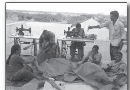
CHE Sewing Project on top of widows' home.

“Therefore everyone who hears these words of Mine, and acts upon them, may be compared to a wise man, who built his house upon the rock. And the rains descended, and the floods came, and the winds blew and burst against that house; and yet it did not fall, for it had been founded upon the rock.” Matthew 7:25-25.